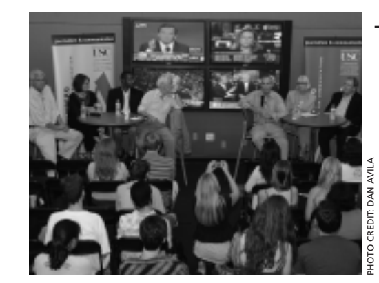
Students engage with a panel of political science and communication experts during a live political convention broadcast

Quarterly Updates for Guidance Counselors Fall 2008